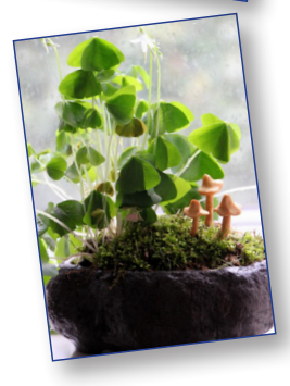
MARCH 16 Leprechaun Garden Bowls

We'll create sweet little heart shaped ring dishes from clay.